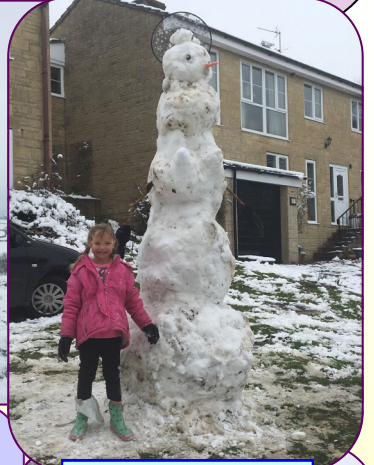
Fun in the snow!